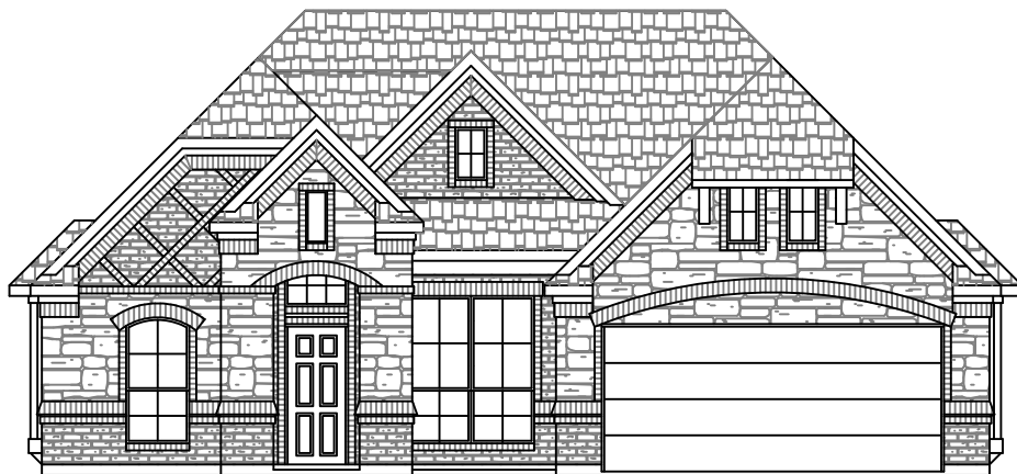
ELEVATION "C" W/OPTIONAL STONE