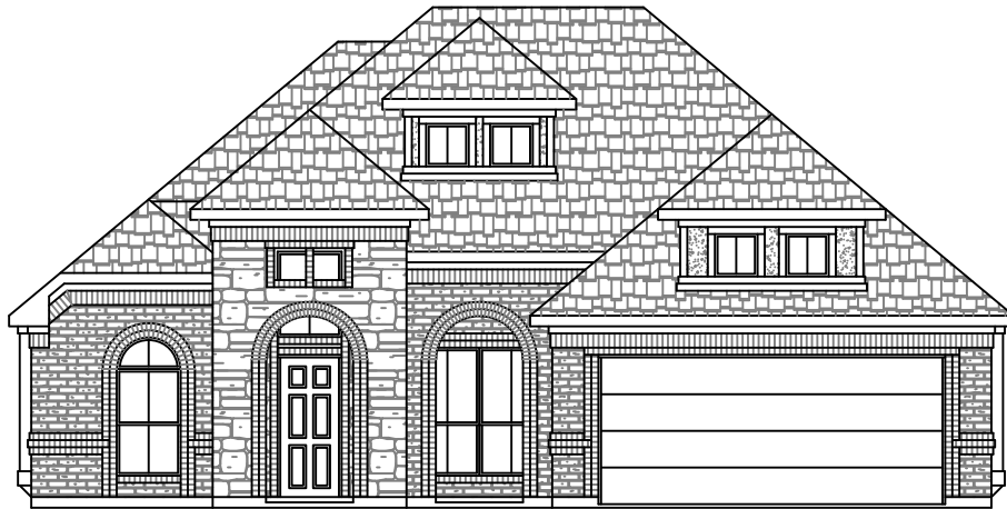
ELEVATION "B" W/OPTIONAL STONE