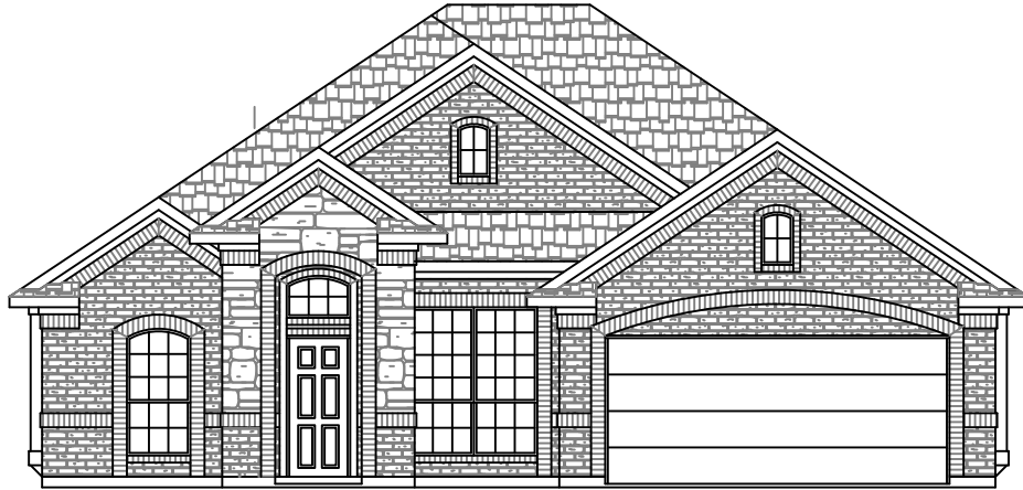
ELEVATION "A" W/OPTIONAL STONE